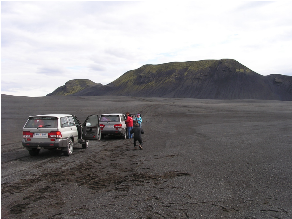
Approaching a sub-glacial volcanic ridge by 4x4 cars with students, Iceland.