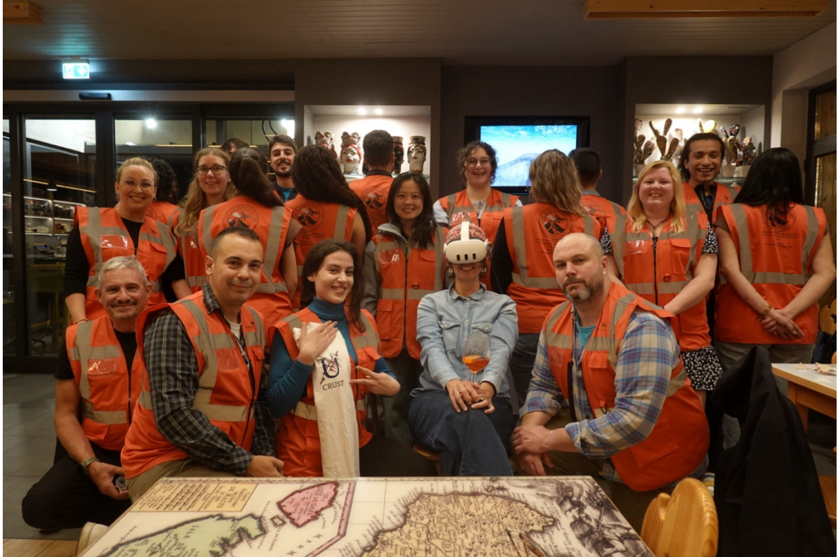
“International School on Drone and VR for Volcano-Tectonic Studies at Etna”, 29 September - 3 October 2025, Italy.