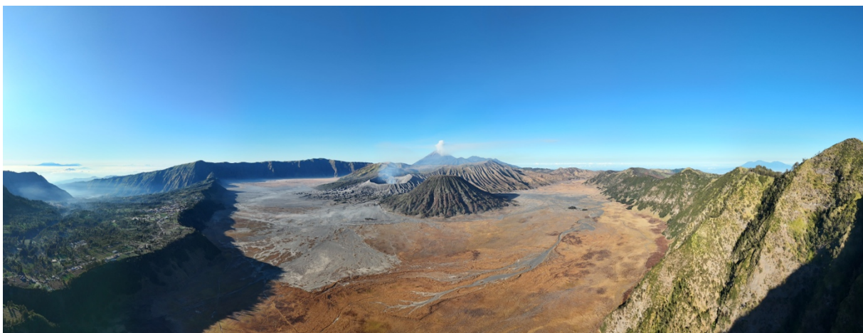
Drone image of the Bromo caldera in Indonesia, Java Island, one of the most dangerous volcanoes; note the villages on the left side, built on the caldera's rim. In the background, Semeru volcano, which produced a pyroclastic flow in November 2025.