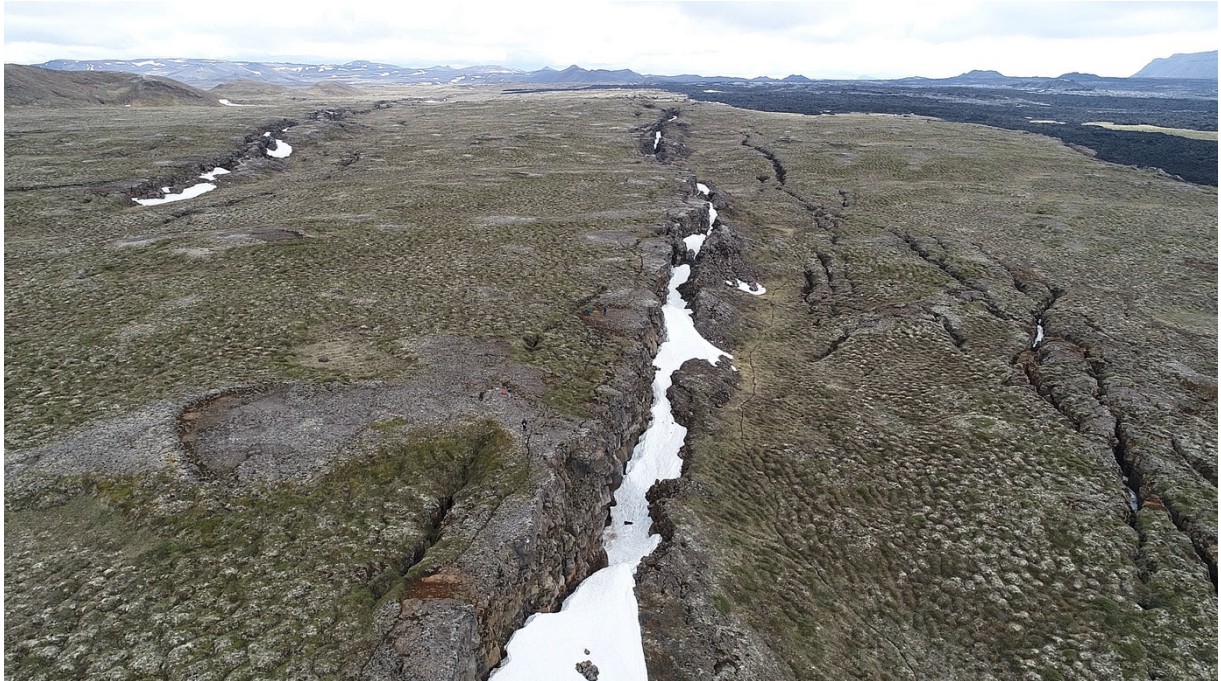
Drone image of normal faults and fissures produced by underlying dikes, Northern Volcanic Zone, Iceland.