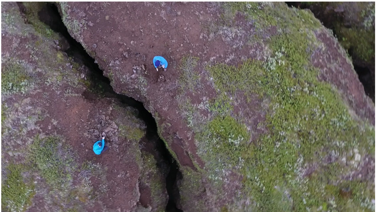
Dilation amount of volcanotectonic fissures can be directly measured by drone.