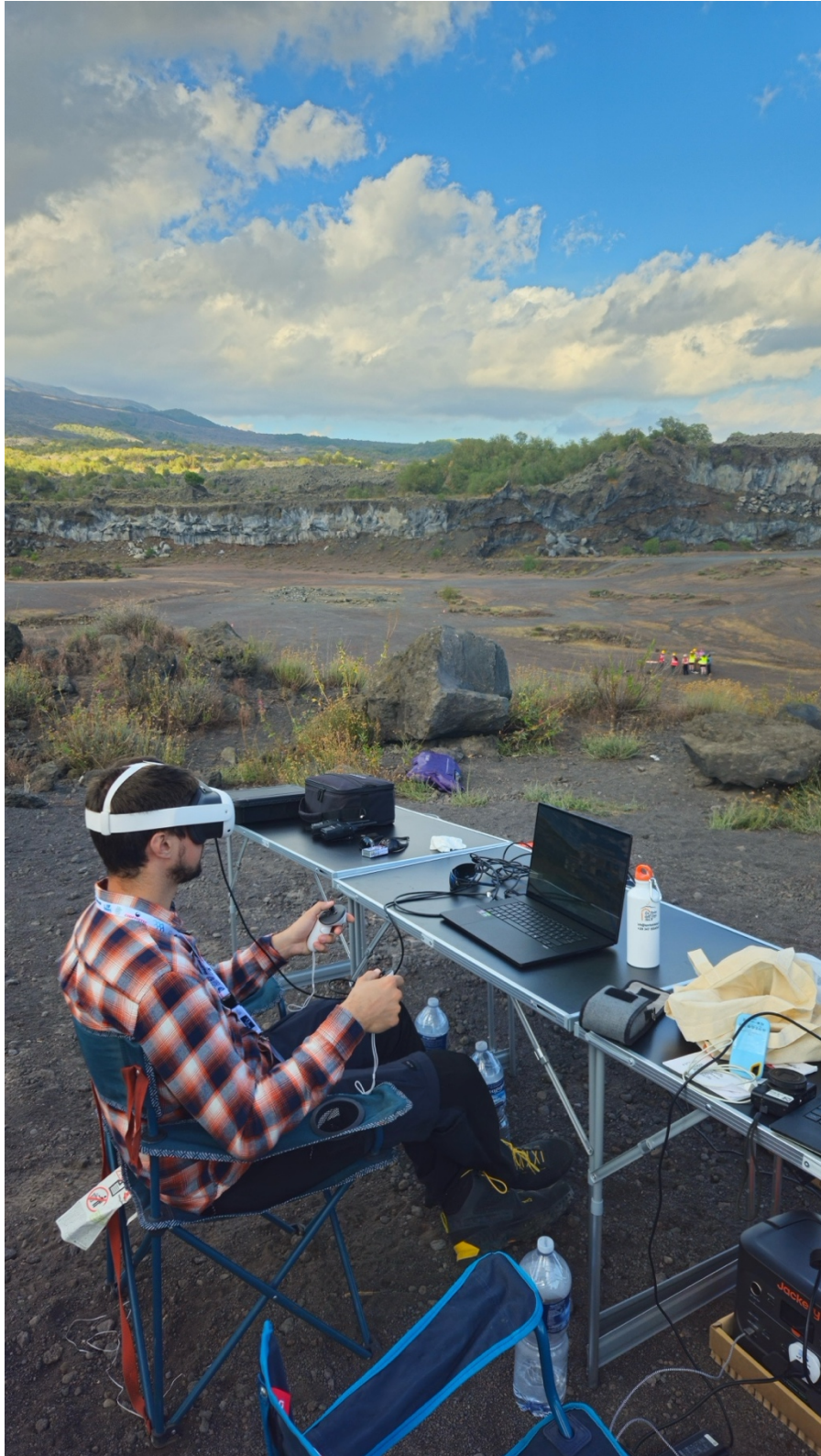
“International School on Drone and VR for Volcano-Tectonic Studies at Etna”, 29 September - 3 October 2025, Italy.